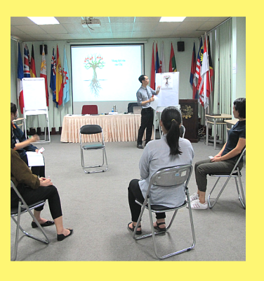
Day 4 - Goal setting and Team building skills

A training course on "Soft-Skills Training - Module 1" was conducted on July 28-31, 2020 by SEAMEO RETRAC to provide the participants with knowledge and skills on effectively teaching soft skills to university students. Also, the course provided participants with plenty of opportunities for discussions and debates on potential approaches for trainers to train their own students in the most invigorating and captivating